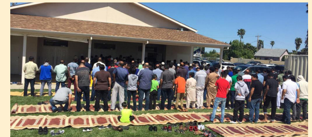
People praying in the open during Friday gathering